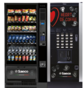
Artico L + Atlante Evo 700